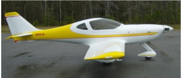
Linda and Joe’s N59JL.

Another subject is gear leg / main wheel shimmy. As a short background on this subject, many “round rod” gear leg airplanes seem to see this phenomenon. I have done quite a bit of research on this subject and there seem to be many variables as to why this happens. By the way, when you copy one person’s idea it is called plagiarism, but when you copy lots of people’s work it is called research, and that is what we have been doing. Anyway, the RV series of aircraft have been dealing with it for many years and their solution, as noted on their gear leg and wheel pant plans, is to stiffen the gear legs by fiberglassing a hard wood shaped dowel to the aft of the gear leg. That obviously is a lot of work so Joe and Linda Mathias and I wanted to try something simpler. We clamped a “V” shaped length of aluminum to the aft side of Linda’s gear legs and she has been flying with that for a while now with good results. However, there may be something even simpler that we should try first that is discussed below.