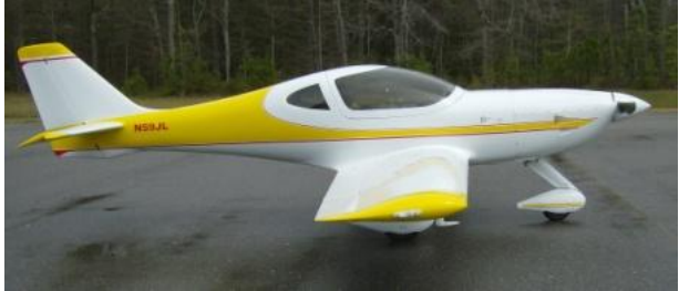
Linda and Joe’s N59JL.

Another subject is gear leg / main wheel shimmy. As a short background on this subject, many “round rod” gear leg airplanes seem to see this phenomenon. I have done quite a bit of research on this subject and there seem to be many variables as to why this happens. By the way, when you copy one person’s idea it is called plagiarism, but when you copy lots of people’s work it is called research, and that is what we have been doing. Anyway, the RV series of aircraft have been dealing with it for many years and their solution, as noted on their gear leg and wheel pant plans, is to stiffen the gear legs by fiberglassing a hard wood shaped dowel to the aft of the gear leg. That obviously is a lot of work so Joe and Linda Mathias and I wanted to try something simpler. We clamped a “V” shaped length of aluminum to the aft side of Linda’s gear legs and she has been flying with that for a while now with good results. However, there may be something even simpler that we should try first that is discussed below.