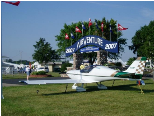
Buz's modified Esqual with lots of Lightning Stuff had the same parking slot in 2006 and 2007.