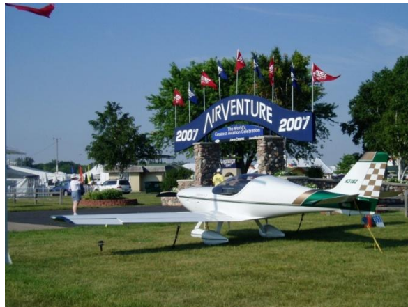
Buz's modified Esqual with lots of Lightning Stuff had the same parking slot in 2006 and 2007.